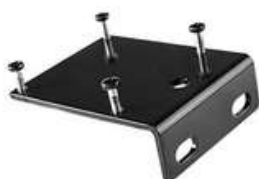
Wall angle SKU: 006.90