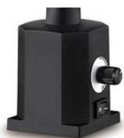
Screw-on flange (incl.)