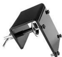
Table clamp 0-44 mm SKU: 007.90