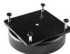
Magnetic base SKU: 008.90