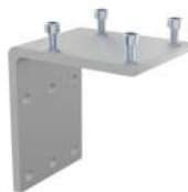
Wall angle SKU: 00295