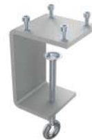
Table clamp 16-85 mm SKU: 00495