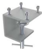
Table clamp 0-44 mm SKU: 00395