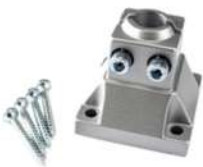
Screw-on flange (incl.) SKU: 00595